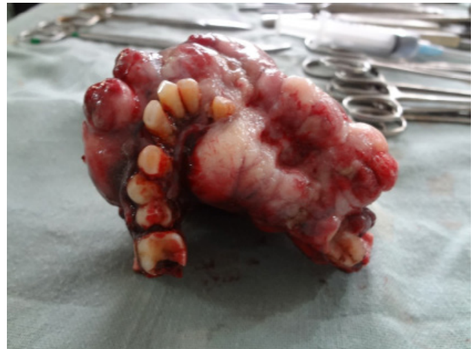
Figure 4: Tumour after resection

grade), intra compartmental anatomic location of the tumour was diagnosed and treatment plan was established.