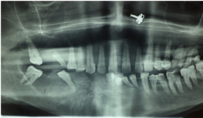
Figure 2: showing sunburst appearance of the right jaw adjacent to the first premolar

of left 2nd premolar and was edentulous with only 2nd premolar and first molar on right side (Figure 2). Bone scan shows abnormally increased uptake of radionuclide in lower jaw region and focal area of abnormal increased uptake of radionuclide in right femur (Figure 3).