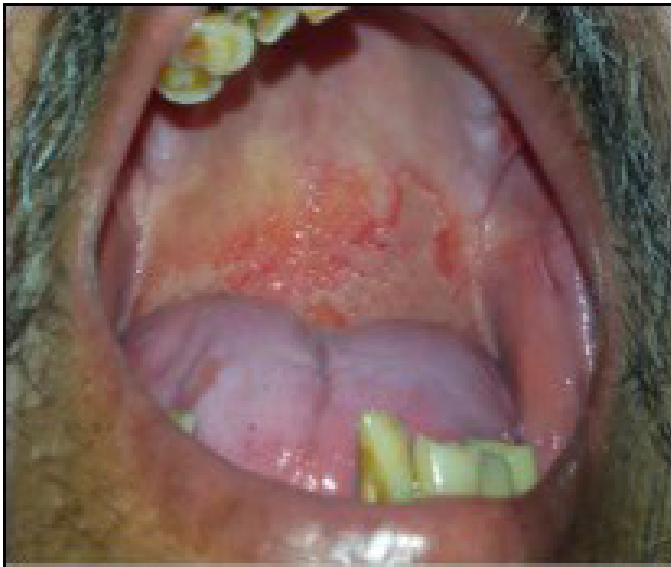
Fig 1: Grade 3 Oral Mucositis

undergoing head and neck radiotherapy had mucositis. The mean age of the cases was 57 years and more than two third (73%) of them were men. The most common primary tumor location was tongue. The majority of cases were in TNM stage II and III. Cases were receiving the mean cumulative dose of standard radiation therapy of 2 Gy per fraction, 5 fractions per week. All the cases were receiving concomitant chemotherapy.