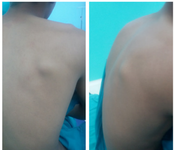
Figure 1: Clinical photo showing swelling arising from right scapula

Osteochondromas of scapula are rare benign bone tumours. They can present with pain, restricted shoulder range of motion and sometimes with pseudowinging of scapula. Surgical excision may provide an excellent clinical outcome, as evidenced by this patient.