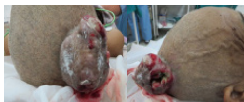
Swelling at the time of presentation

A 72 years old lady from eastern part of Nepal presented with a large globular ulcerated swelling with cavities seen on lateral aspect of swelling over right Parietal region since adulthood but she do not know the exact duration. It was painless and was covered by hair during her adulthood. The swelling had become prominent during the fifth decade of life. Ulcer was developed 6 months back and onset of pain and bleeding from the wound site since three month duration which compelled her to seek medical attention.