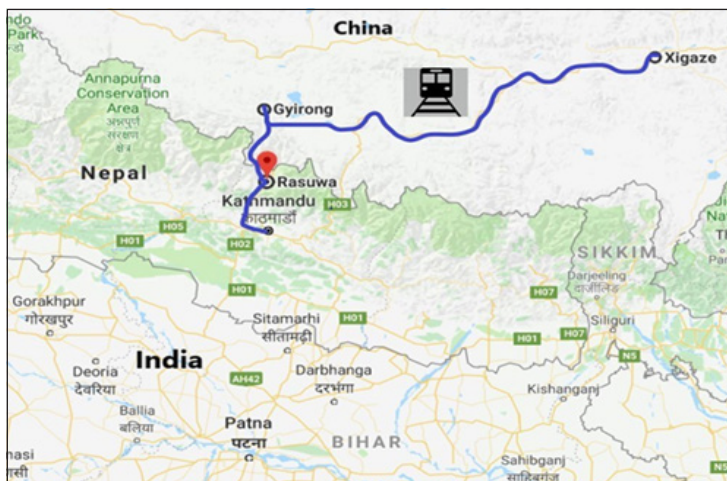
The planned extension of the Qinghai-Tibet railway to Kerung (Gyirong) and into Nepal.

First, excluding Kathmandu, the Chinese Qinghai-Tibet railway already fully operational up to Shigatse (Xigaze) is expected to soon reach the Nepal border (Rasuwagadi) in Kerung (Gyirong). From Kerung it will be a 100-km-long railway to Kathmandu. A combined transportation system of rail and truck via that route reduces the journey substantially; China has already started sending cargoes on freight train from Lanzhou to Kathmandu via Shigatse, where the merchandise is loaded on trucks. The whole journey takes only 10 days, much less than the 35 days it takes through the maritime route via Kolkata. A Chinese railway in Kerung can thus elevate Sino-Nepal trade and commerce (Map-1).