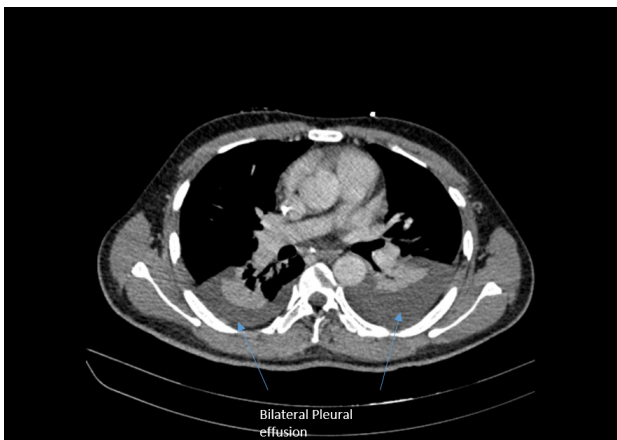
Figure 4: CECT Chest showing Bilateral pleural effusion in the same patient