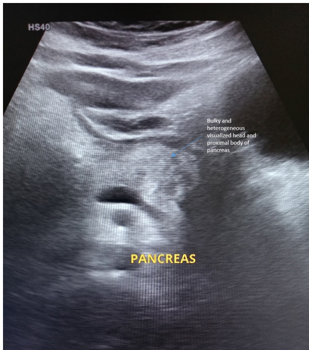
Figure 1. Ultrasound shows Bulky and heterogeneous visualized head and proximal body of the pancreas.

The patient was kept nil by mouth and was treated with intravenous fluids and antibiotics, and analgesics. The patient received two units of platelet concentrate due to thrombocytopenia. During the course of ICU stay, the patient improved gradually with increase in platelets counts, decrease in liver enzymes and resolution of abdominal pain. He was discharged in stable condition after 10 days of ICU admission.