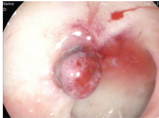
Figure 2: Duodenal lesion was raised with saline submucosal injection and was grabbed with band ligation