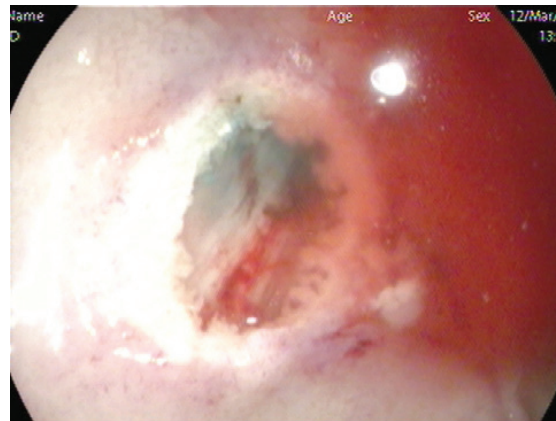
Figure 3: Duodenal submucosal lesion was resected endoscopically with a snare

The biopsy from the resected duodenal lesion confirmed the duodenal NET with the margin free of the tumor. The patient was followed at 6, 12, 18 and 24 months. During the follow up visits, the repeat upper gastrointestinal endoscopy did not show recurrence of the lesion and there was no any evidence of distant metastasis either.