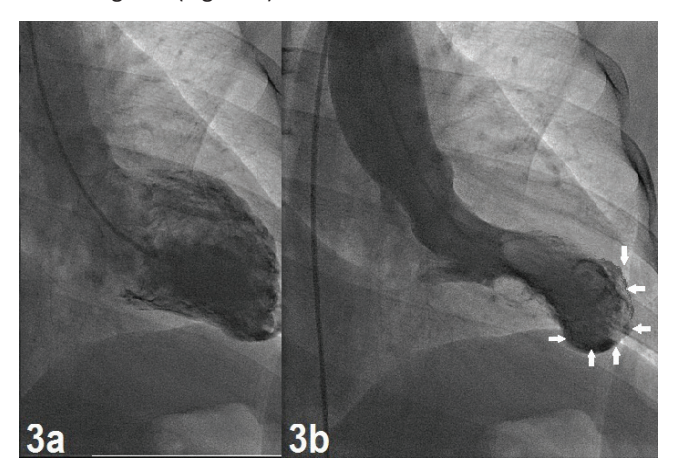
Figure 3a. Left ventriculography in diastole and 3b. in systole showed akinetic apical and inferior segments of the left ventricle

Right coronary artery was non dominant. Left ventriculography showed end-systolic akinetic apical territory but hyperkinetic remaining wall (Figure 3).