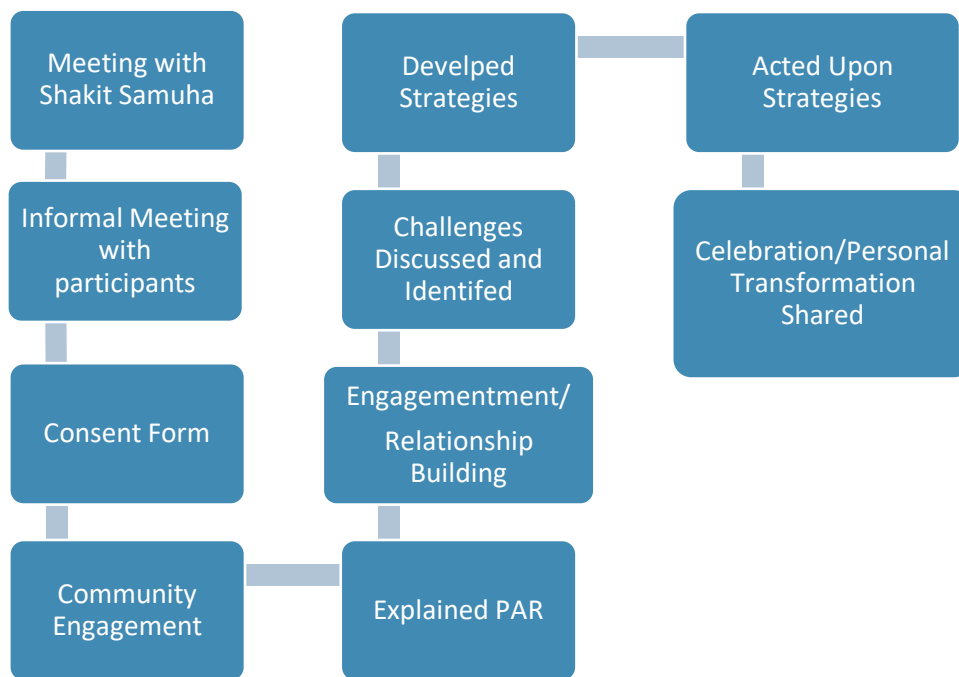
Figure 1: This diagram speaks to the study process