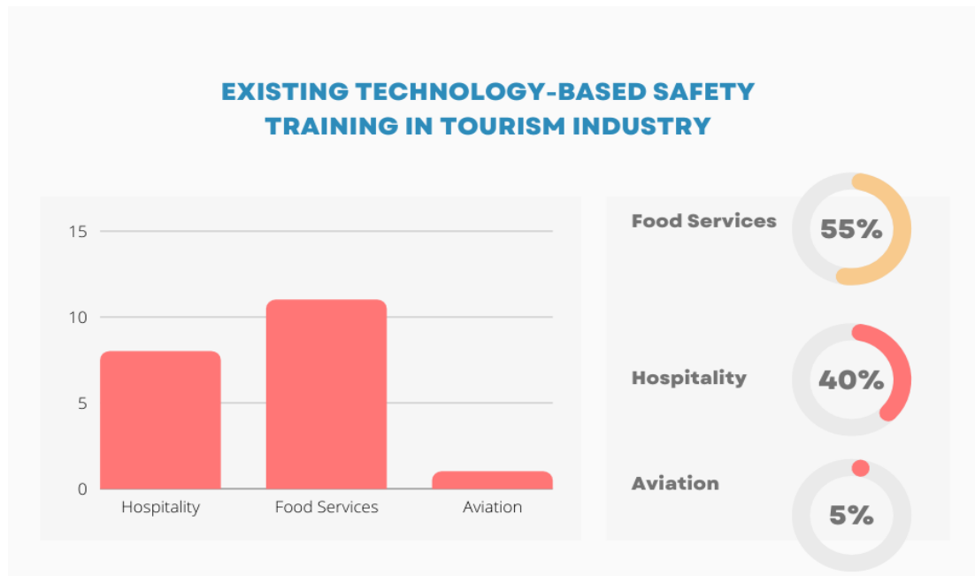
Figure 3: Existing safety training related to technology in the tourism industry (own work, 2023)

training related to tourism or hospitality is likely in hotel management, food management, and kitchen in the aviation sector. 31 Furthermore, the findings on occupational safety training concerned with housekeeper safety and how a lack of proper cleaning equipment harms the food and the workers' safety. 32 This study, however, argues that kitchen workers' safety is vital since this sector is the busiest in the tourism industry.