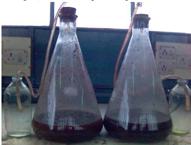
Figure 1. Anaerobic batch reactors with gas collection

Poultry litter was collected from the Live Stock Research station of Sri Venkateswara Veterinary University (SVVU), Rajendranagar, Hyderabad, Andhra Pradesh, India in sundried conditions. The litter was brought to work place as per requirement and stored in dry condition. Poultry litter slurry was prepared from the same storage and fed to the digester everyday as per requirement. The experimental set up consisted of 5litre anaerobic conical flasks and biogas vent through water reservoir as shown in Fig.1. Initially, fresh poultry droppings were characterized for pH, Total solids (TS), Volatile solids (VS), Fixed solids (FS), Total Kjeldahl nitrogen (TKN), Ammonical nitrogen ( \text{NH}_4\text{-N} ) and Organic nitrogen.