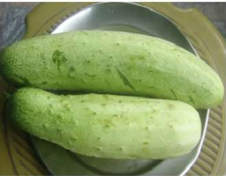
Fig. 2: Fruits of cucumber plant