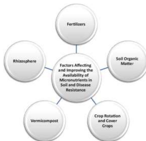
Fig. 2: Factors improving the availability of micronutrients in soil.

Proper balance of both macro and micronutrient is necessary for the growth and development of plants. Integrated nutrient management balances both the macro and micronutrients. In recent years, due to the massive use of inorganic fertilizers and decrement in soil pH, most of the soil is devoid of micronutrients. Mostly, micronutrients in soil are gained from the decomposition of organic