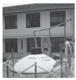
Partial under ground Ferro cement tank

The most significant impact of the rainwater harvesting system in Sri Lanka is the ensured supply of water in the homestead. Domestic rainwater harvesting system increased the use of water per capita from 28 lpcd (liters per capita per day) in non-beneficiary households to 43 lpcd in beneficiary households (Ariyabandu 1999). The harvested rainwater that is stored in the tanks also acts as a source of water for small-scale home gardens. It also has introduced water conservation practices with use of drip irrigation and water management systems. Mushroom cultivation, poultry and goat rearing and running of boutiques are some of the economic activities that households are able to engage in as a result of having a rainwater harvesting tank. Increased use of water for toilet and washing purposes is seen in beneficiary, and households will indirectly achieve improvement in personal health.