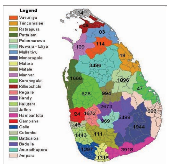
Figure 2: Distribution of Rainwater Harvesting Systems in Sri Lanka

Accordingly, the rainfall pattern divides the country into two climatic zones—the wet zone and the dry zone. The wet zone receives an average annual rainfall of 2350mm