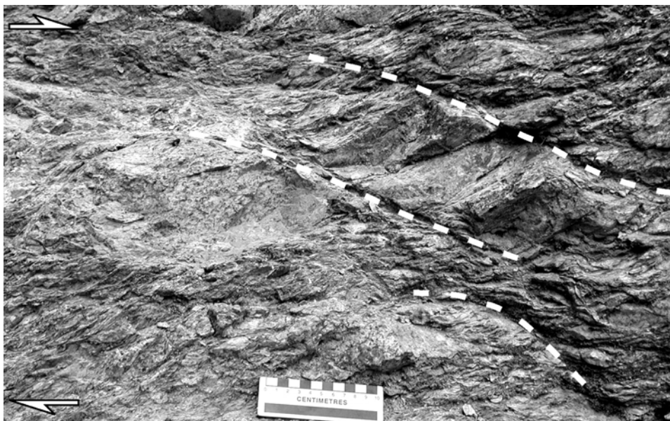
FIGURE 1. Sheared serpentinite near to the bottom of Luobusa ophiolite. The attitude of foliation is N20°W, 34°S and striation on the surface of sheared fragment of peridotite trends N13°W. Broken lines indicate C'-type shear bands (N80°E, 31°N) suggesting top-to-the-north displacement. Scale bar on the bottom is 10 cm.

A serpentine melange zone, which lies along the northern margin of ophiolite sequence occupies the structural bottom of Luobusa ophiolite. The serpentine melange zone contains lenses of gabbroic rocks, pillow lavas and Cretaceous marine sedimentary rocks. These rocks occur as blocks in a partly serpentinized ultramafic matrix. Individual lithologies are irregularly distributed and the serpentinite matrix is intensively deformed. In the outcrops and oriented samples sets of subparallel shear bands and minor shear zones occur in the serpentinite. The shear bands are oblique to foliation in serpentinite and are regarded as "C'-type shear bands" (Figure 1). Consistent top-to-the-north displacements are observed at three localities in the serpentine melange zone.