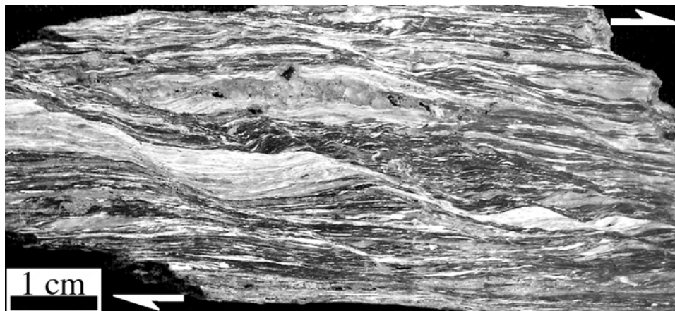
FIGURE 2. Polished surface of sheared phyllite in Triassic sedimentary rocks near to the top of mantle peridotite. C'-type shear bands displacing compositional layering indicate top-to-the-northeast displacement. The attitude of foliation is N74°W, 54°S and the trend of mineral lineation is N46°E.