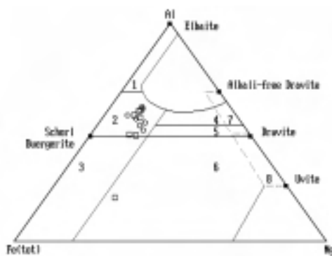
FIGURE 2. Fe (tot)-Al-Mg ternary plot for tourmalines of EPG ( \square ) and TLg (o). Fields 1- Li-rich granitoid pegmatites and aplites; 2- Li-poor granitoids and their associated pegmatites and aplites; 3- \text{Fe}^{3+} rich quartz-tourmaline rocks (hydrothermally altered granites); 4- metapelites and metapsammities coexisting with an Al-saturating phase; 5- metapelites and metapsammities not coexisting with an Al-saturating phase; 6- \text{Fe}^{3+} rich quartz-tourmaline rocks, calc-silicate rocks, and metapelites; 7- Low-Ca metaultramafics and Cr, V-rich metasediments and, 8- metacarbonates and meta-pyroxenites (after Henry and Guidotti 1985).