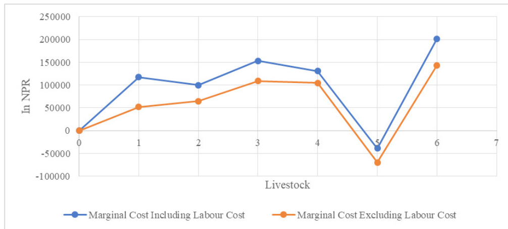
Figure 1: Marginal Cost by Herd Sizes with and without Labour Cost

Table 7 shows that the marginal cost including labour cost of livestock was found to be less than the marginal benefit of each herd except the livestock with total numbers of livestock 3. On the other hand, marginal cost excluding labour cost was also found to be less in comparison to the marginal benefit marginal benefit.