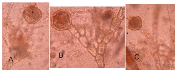
Fig. 2 (A-C). (A) Bulbochaete elatior f. pumila , (B) Bulbochaete pseudoelatior , (C) Bulbochaete triangularis var. bengalensis .

Distribution: South-West Asia like India.