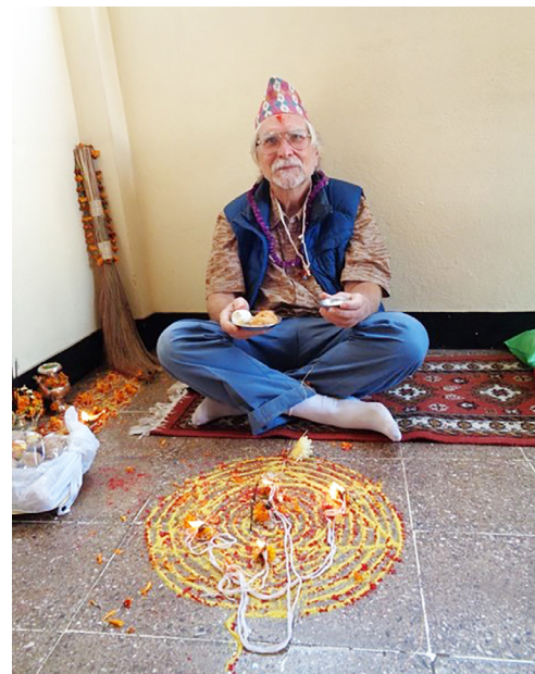
Gregjee ready to have the Shagun (Omen), an item compulsory in Newar Culture.