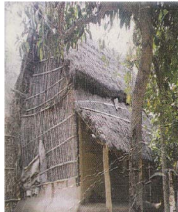
House of the Mahato