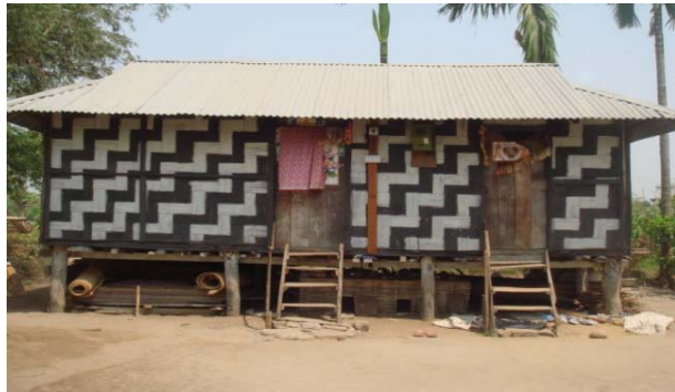
A Kisan house for community meeting