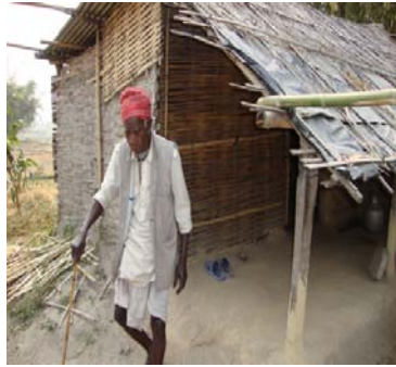
An old Kisan going to Kisan court