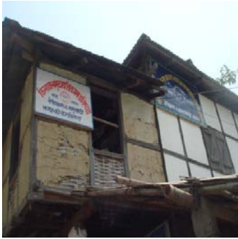
A Kisan house used for offices of the Kisan court and the club