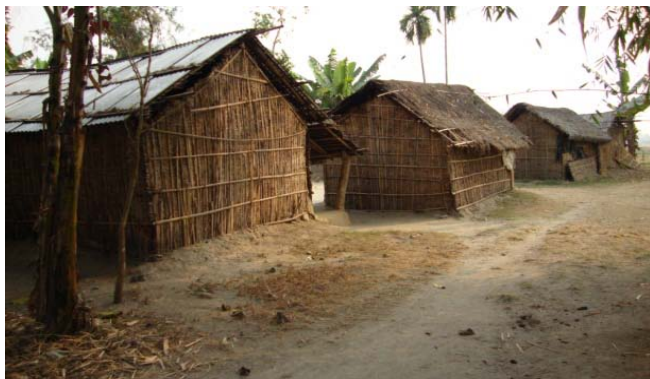
Kisan houses are turn opposite of the road