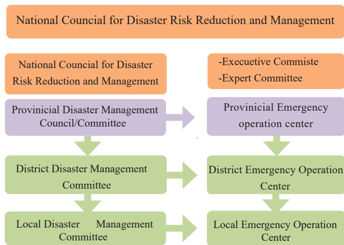
Fig.1: National Disaster Management Structure

As per the framework, District Disaster Management Committee (DDMC) and Local Disaster Management Committee (LDMC) are two mechanisms active at the local level to render effective response (Disaster Risk Reduction and Mitigation Act, 2017) (see Figure 1). DDMC remains at the district level which is moreover a coordinating entity focuses on response operations whereas LDMC remains at