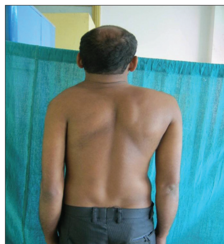
Figure 1: Sprengel's deformity of left shoulder. The left shoulder is elevated to higher level than right shoulder

Eulenberg first described the deformity what later became known as Sprengel's deformity, as high-grade dislocation of the scapula in 1863. 3 Then after two decades, Willet