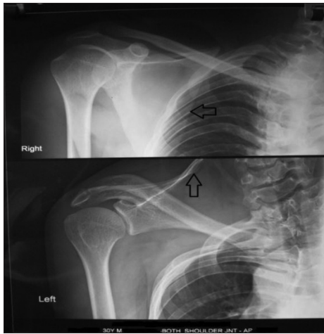
Figure 2: X-ray of right shoulder region showing scapula at normal position (arrow pointing towards left). The scapula is missing from normal position on the left side and omovertebral connection is seen (arrow pointing upwards)