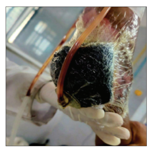
Figure 2: Negative pressure wound therapy air tight dressing

stays in comparison of both therapies Group A patients had less hospital stay than that of Group B patients but Group A had longer total duration of wound healing as compared to Group B. The mean value of Granulation Tissue Score in Group A was 2.10\pm0.73 and in Group B was 1.90\pm0.60 . We found that there is improvement in the granulation tissue score in both therapies which is consistent with other studies.