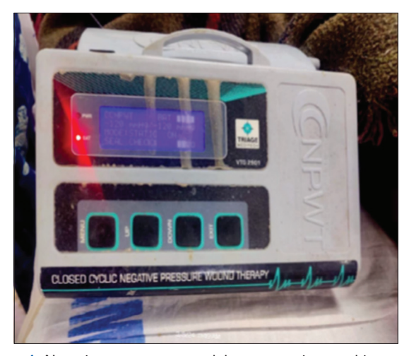
Figure 1: Negative pressure wound therapy suction machine