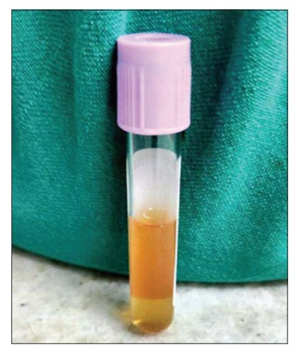
Figure 5: Platelet rich plasma preparation