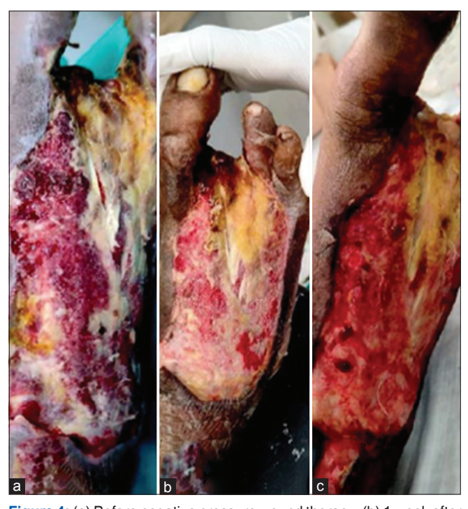
Figure 4: (a) Before negative pressure wound therapy, (b) 1 week after negative pressure wound therapy, (c) 4 weeks after NPWT.