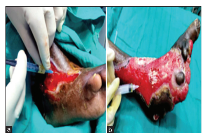
Figure 6: Platelet rich plasma application