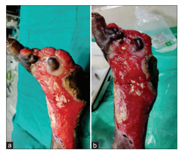
Figure 7: (a) Before platelet rich plasma application, (b) 4 weeks after platelet rich plasma application (wound is ready for grafting)

NPWT therapy improving the clinical efficacy of chronic wounds. In the study by El Nagar et al.,<sup>2</sup> reported the hospital stay with a mean 4.88±1.73 week in PRP group and 2.0–10.0 weeks with a mean 4.38±2.56 week in NPWT group (P=0.312). In the study Seidel et al.,<sup>7</sup> reported that the