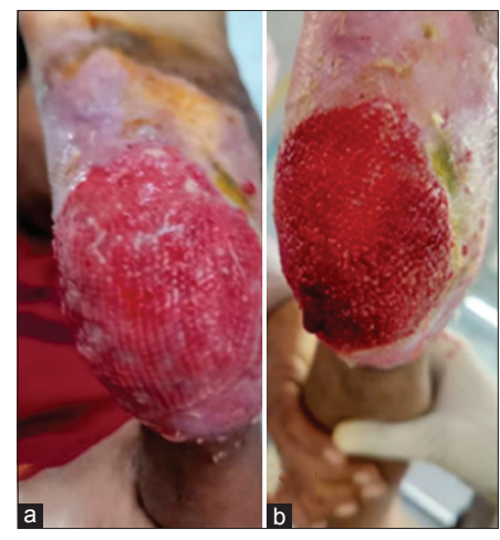
Figure 3: (a) Before negative pressure wound therapy, (b) 1 week after negative pressure wound therapy

A meta-analysis was conducted by Chen et al.,<sup>6</sup> in which 18 RCTs involving 1294 patients with chronic wounds were included, showed that the combined effect of PRP and