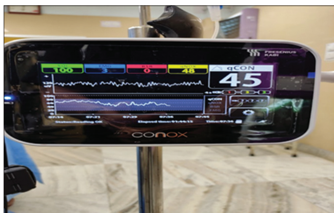
Figure 1: The conox monitor

BMI: Body mass index, IQR: Interquartile range. *P-value were found significant in height and BMI