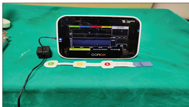
Figure 2: The conox monitor with strips