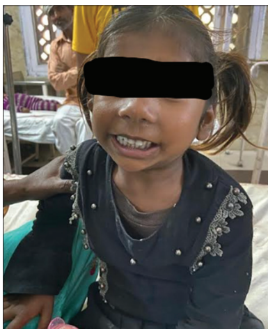
Figure 2: Mouth opening <2 mm