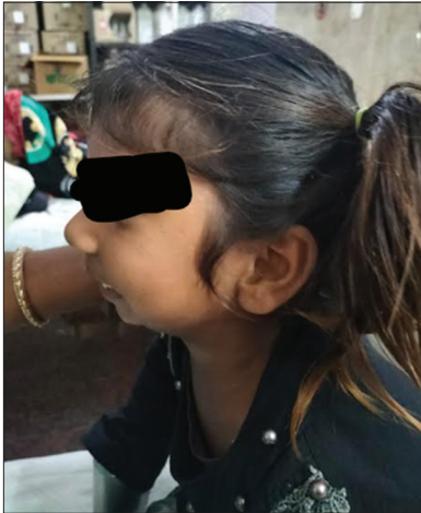
Figure 1: Temporomandibular joint ankylosis with very less mouth opening