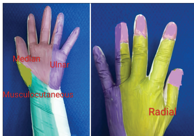
Figure 2: Sensory block assessment