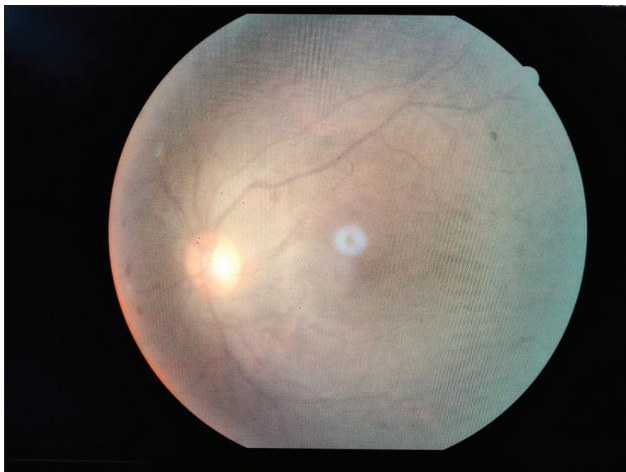
Figure 3: Left eye fundus examination—media obscured by lens opacification, medium-sized optic disc with 0.4:1 cup-to-disc ratio, horizontal notching of the retinal rim, normal vessels, and healthy macula

of POAG. We found that 5 males and 3 females were diagnosed with POAG. This finding contrasts with some