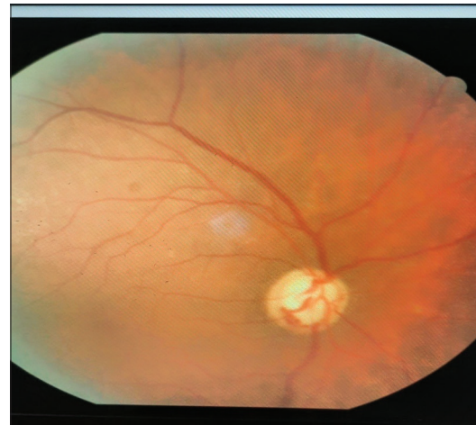
Figure 4: Optic disc examination revealing 0.8:1 cup-to-disc ratio with inferior and superior disc thinning; macular hemorrhage noted