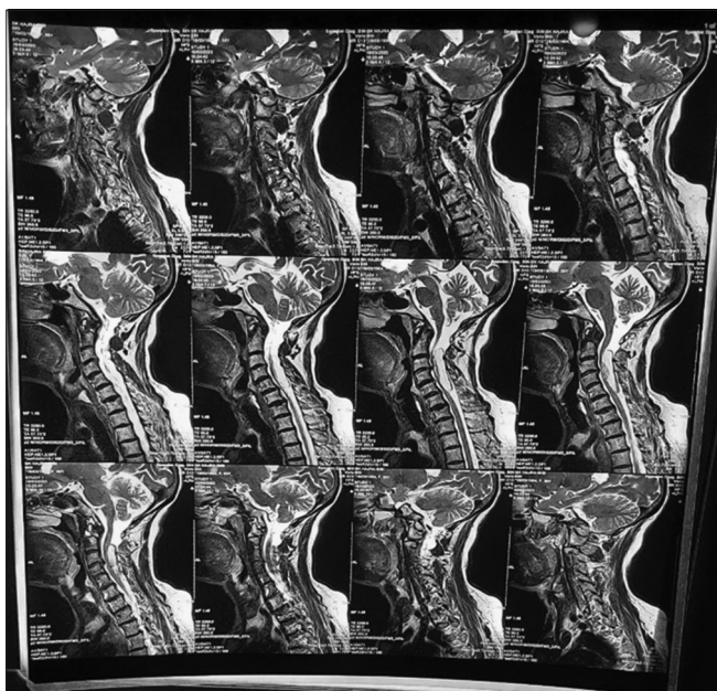
Figure 1: Sagittal T2-weighted images showing the intradural SOL at C2-C5