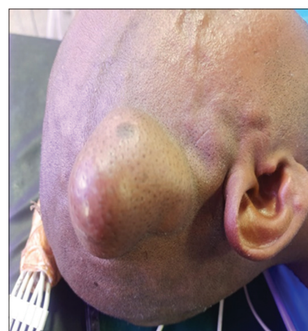
Figure 1: Gross image of the cricoid aneurysm

progressively in size. The patient had complaints of headache and growing size of the swelling for which he was cosmetically concerned as shown in Figure 1. The