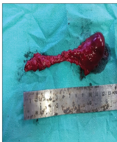
Figure 4: Excised cirroid aneurysm

swelling was soft, pulsatile with palpable thrills and bruit. The swelling diminished in size when the feeder vessels were compressed.