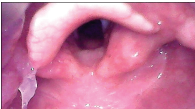
Figure 2: The view obtained with custom-made video laryngoscope