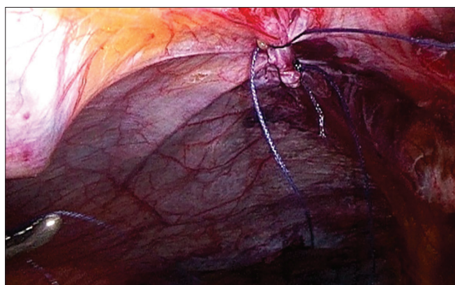
Figure 1: Intraoperative peritoneal rent

This study aims to investigate and optimize the management of peritoneal rent encountered during the extended view total extraperitoneal (eTEP) approach for inguinal hernia repair. The primary objective is to assess the feasibility and efficacy of intraoperative repair of peritoneal rent within the extraperitoneal space. Secondary objectives include determining the incidence and risk factors associated with peritoneal rent, comparing outcomes between extraperitoneal and intraperitoneal repair approaches, evaluating the impact on operative time and additional resources, assessing postoperative complications, and conducting a comparative analysis with standard eTEP procedures. The study seeks to provide evidence-based insights to enhance the safety and efficacy of eTEP surgery and contribute to the ongoing evolution of minimally invasive hernia repair techniques.