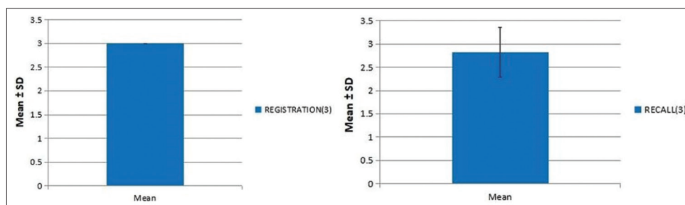
Figure 2: Mean score with standard deviation of registration and recall in the study population