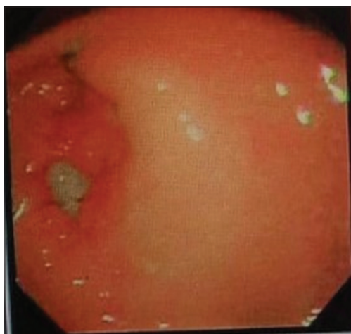
Figure 2: Endoscopic view of chronic deep ulcers in indurated margins