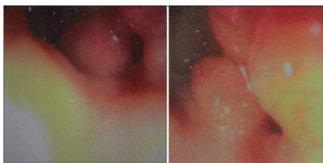
Figure 1: Endoscopic view of the duodenal mass being biopsied

On microscopy, duodenum was lined by a hyperplastic columnar epithelium, lamina propria and submucosa showed a sheet of brunner's gland, and lobules of gland were separated by septae of proliferative smooth muscles. Some of nests of brunner's gland were cystically dilated with scant mitotic activity and extended up to the base of the duodenal villi admixed with chronic inflammatory infiltrate. The overall growth pattern of the gland was expansile rather than infiltrative due to which overlying mucosal epithelium was appear to be effaced and showed decreased number of crypts and villi; pancreas was appear to be pushed outwards. No infiltration was noted in circumferential margins or adjacent structures.