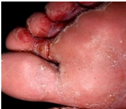
Figure-1: Tinea pedis - On the sole of the foot

4.1. Interdigital Tinea pedis: It occurs in two forms, most common form of this infection usually arise in the interspaces between 4 th and 5 th toes, occasionally spreading to the underside of the foot. First type of interdigital tinea pedis, known as Dermatophytosis simplex , is largely asymptomatic and presents as dry, scaly, minimally peeling interspaces with occasional pruritus. The second form Dermatophytosis complex is symptomatic and usually presents with wet, macerated interdigital spaces along with fissuring of the interspace, hyperkeratosis, leukokeratosis and erosions.