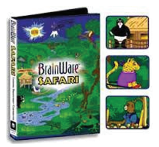
Figure 1: BrainWare SAFARI Program by BrainWare Learning Company

Measuring electroencephalographic activities while performing spatial ability tests run by SuperLab Pro. Version 2.0 (Cedrus Corporation, San Pedro, CA, USA), stimuli presentation, compared to baseline. SuperLab Pro was used to develop spatial ability tests for electroencephalographic measurement. A single-channel electroencephalogram was designed to collect brain activity data from the students' brain. Simplicity and efficiency were the main reasons for designing a single-channel electroencephalographic monitoring system. Electroencephalographic data was analyzed offline and the following frequency bands were computed: delta wave ranging from 0.1 to 3.0 Hz, theta wave (4.0 to 7.0 Hz), alpha wave (8.0 to 13.0 Hz), beta wave (14.0 to 30.0 Hz), and gamma wave (31.0 to 47.0 Hz), respectively.