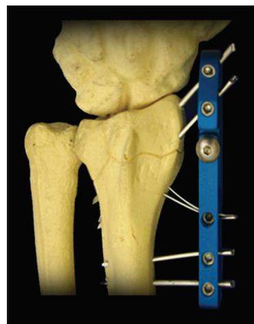
Figure 1: Application of Cobra Ex-fix on bone module

Among A2 patients, the reduction achieved by the cobra fixator was excellent in 80%, and good in 20%. Both B1