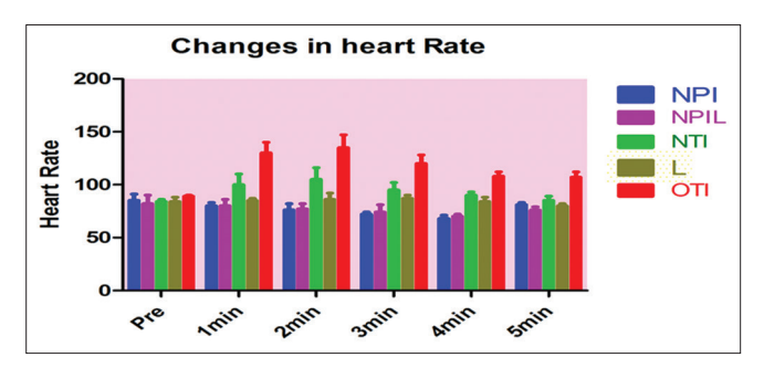
Figure 2: Heart rate changes (beats/min) in each group after intubation compared to pre-procedure values

Nasotracheal intubation (NTI) is one of the commonest methods used to induce anaesthesia for surgeries of the head and neck region. NTI involves the tracheal tube to pass through nose hence allowing better isolation and good surgical access for intraoral procedures.