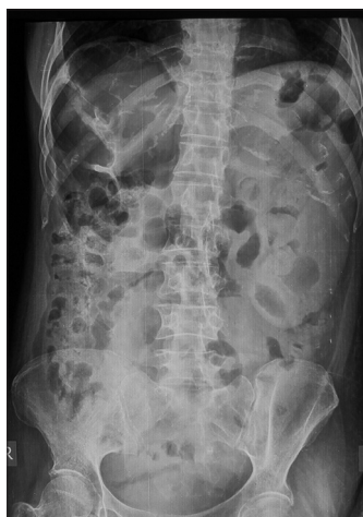
Figure 1: Colonic dilatation

Her plain abdominal film showed dilatation of the colon (Figure 1) and contrast enhanced computerized tomography of the abdomen revealed a grossly distended sigmoid colon with normal proximal colon and normal distal transition to rectum suggestive of colonic pseudo-obstruction (Figure 2). Her blood investigations showed hyponatremia of 130 mEq/L (136-146), hypokalemia of 2.8 mEq/L (3.5 – 5) and hypomagnesemia of 1.27 mg% (1.5 – 2.3). Her arterial blood gas showed metabolic alkalosis. Her urine potassium was 15mmol/day, which was suggestive of an extra-renal loss; and urine microscopy was normal. Her complete blood count, renal and liver functions were normal. Serum calcium was 8.5 mg/dL (8.7 – 10.2) and thyroid profile was normal. HbA1c was also within normal range. ANA and Anti dsDNA were negative. ECG and chest X-ray were normal.