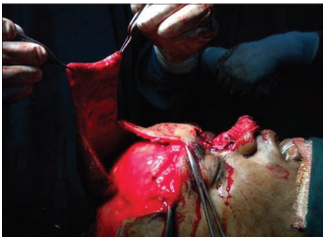
Figure 6: Scalping forehead flap harvested