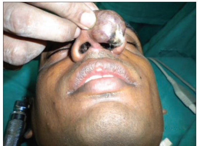
Figure 4: Bleeding point over inferior most aspect of the swelling covered with a scab