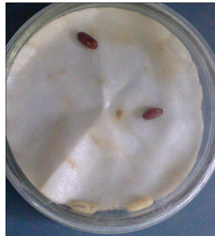
Figure 2: Gross image of larva and pupae of Musca domestica

cases: one associated with persistent passage of maggots in stool and urticaria; and the other associated with altered bowel habits, weight loss and inflammatory changes in lower gastrointestinal tract. It was not possible to identify the specific source of exposure in both the cases. There is possibility of eating contaminated food over prolonged duration from street vendors and other places. To rule out delusional parasitosis, we asked the patients to collect stool sample in hospital which also showed similar findings. Though purgatives and albendazole have been used as treatment options, the larvae are usually refractory to treatment. Best strategy is to try to identify the responsible food source and eliminate it from diet. 3,4