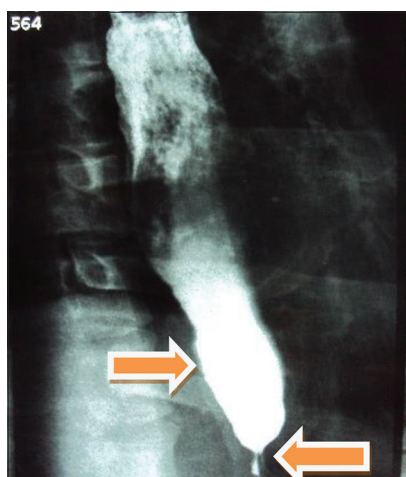
Figure 2: Barium oesophagogram showing proximal dilatation with short segment narrowing in the distal oesophagus

up, he had no fresh episode of haemoptysis and chest X ray show resolution of consolidation. Pneumatic dilatation of the affected oesophageal segment was also undertaken subsequently.